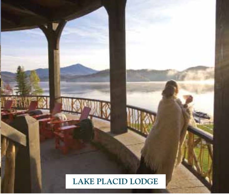
LAKE PLACID LODGE

Stroudsburg tree lighting. Do the jingle bell rock with Fido alongside as the spirit of the holidays begins.